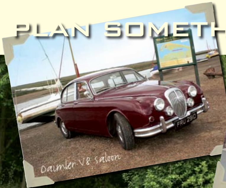
Daimler V8 saloon

Grin broadly as you drive the Daimler into the car park at Blakeney Quay, and enjoy watching heads turn at the throaty burble of her V8 engine.